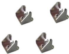
Panel clip * 4