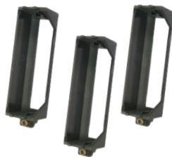
I/O Socket * 3