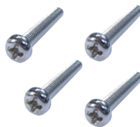
M4 x 30L Screw * 4