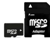
A microSD Card and a microSD to SD Adapter