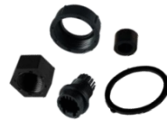
RJ-45 Waterproof Assembly

EMP-9051-32 EMP-9051-16 EMP-9251-32 EMP-9251-16 EMP-9651-32 EMP-9651-16 EMP-9091-32 EMP-9091-16