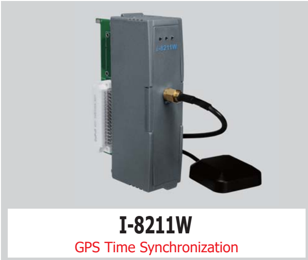
I-8211W GPS Time Synchronization