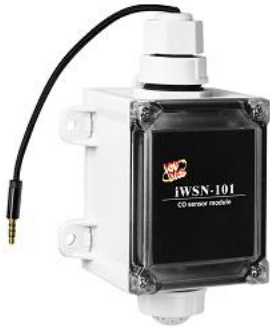
iWSN-101 with Audio cable

In addition to this guide, the package includes the following items: