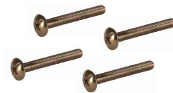
M4 x 30L Screw * 4