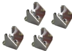
Panel clip * 4