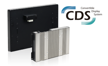
CDS Technology CDS (Convertible Display Systems) is a Cincoze patented technology, which allows for easy system maintenance, upgrades or replacement.

CV-112H/P1101 Series provides extensive I/O, Mini-PCIe slot, 2.5" SATA drive bay, mSATA socket, and SIM card slot. It also supports power ignition sensing and PoE by adding ready-to-use CFM modules.