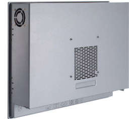
▲ Back view