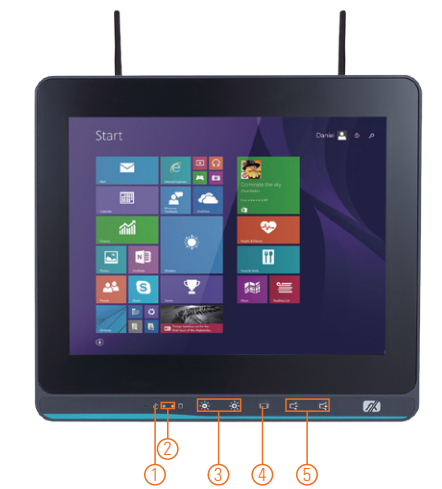
1. Power LED 2. HDD LED 3. Brightness adjust +/-4. Display on/off 5. Volume on/off

With Axiomtek's patent for plastic plus aluminum mechanism design, the GOT110-316 can dissipate the heat easily and keep the system operation stable.