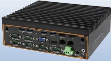
Engineering sample for reference