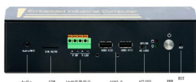
Front IO View