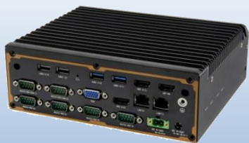
Testing sample for reference