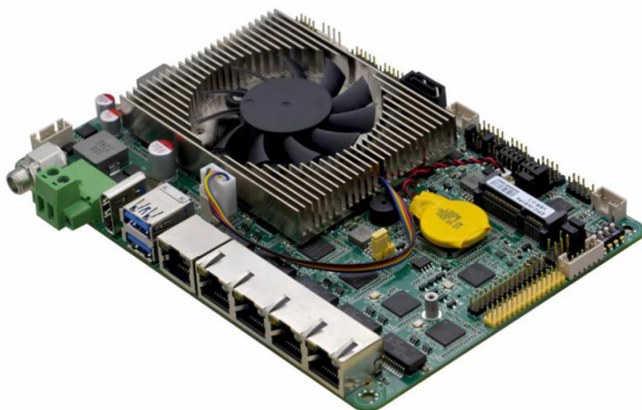
EPIC-W81P4 VER:0.1 Lateral View