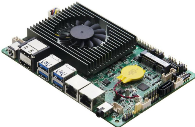
EPIC-EH305_N126L VER:0.1 Lateral View