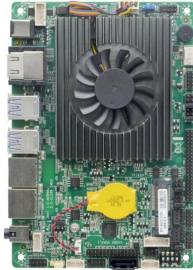
EPIC-EH305_N126L VER:0.1 Front View