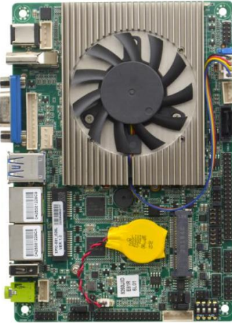
EPIC-E81_I526L VER1.0 Front View