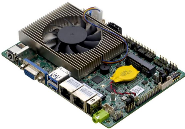
EPIC-E101_I526L VER:1.1 Lateral View