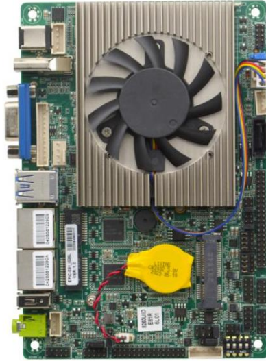
EPIC-E101_I526L VER1.1 Front View