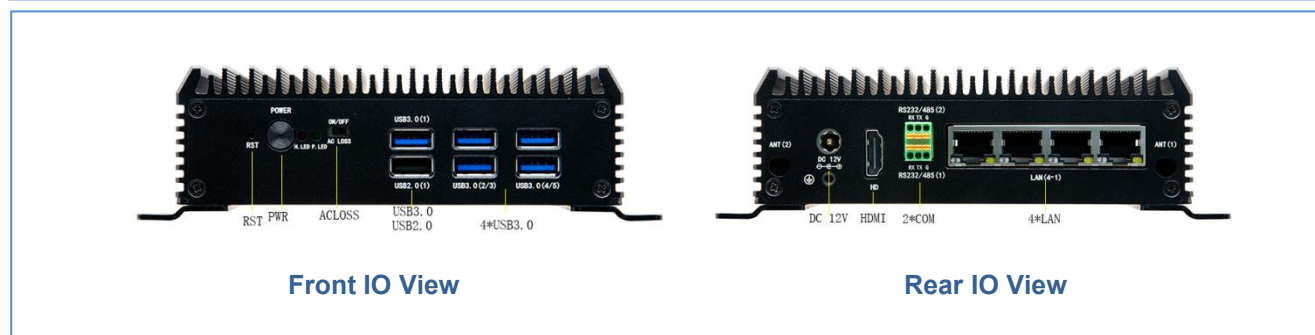
Front IO View