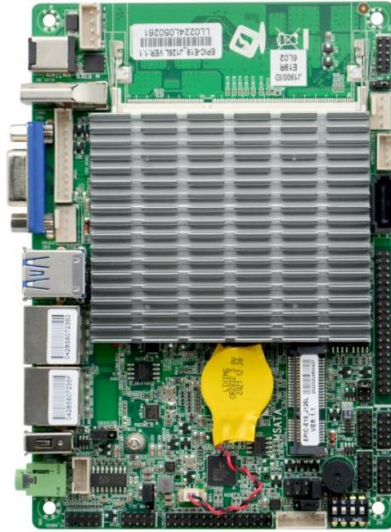
EPIC-E19_J126L VER:1.1 Front View