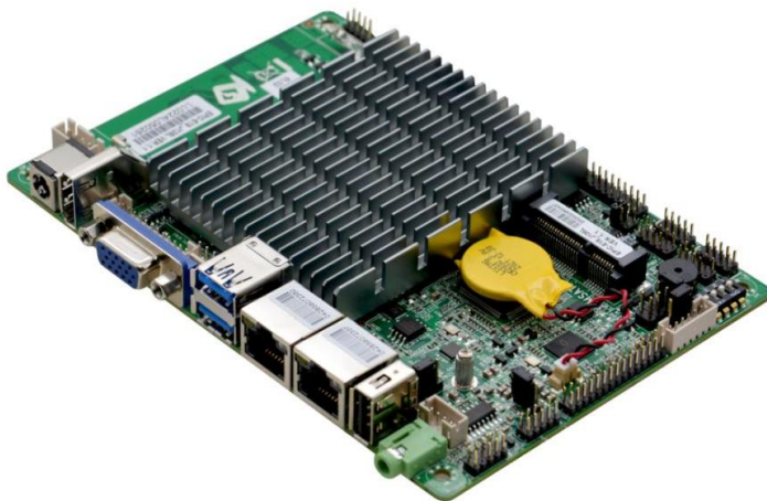
EPIC-E19_J126L VER:1.1 Lateral View