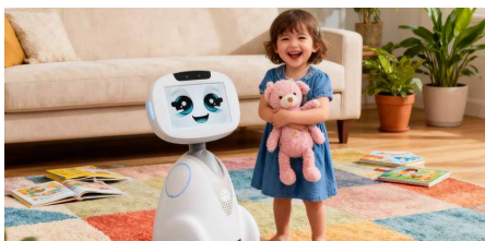
Home Companion Robot