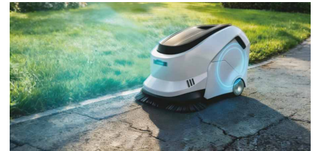
Unmanned Cleaning Vehicle