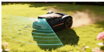
Robotic Lawn Mower