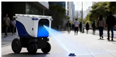
Autonomous Delivery Robot